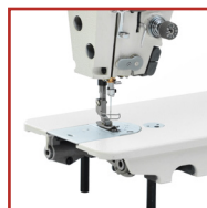
Adjustable LED brightness