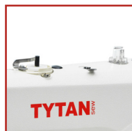
Semi-oil lubrication needle bar