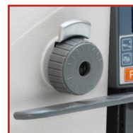
Two times large hook (optional)