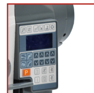
High quality control system